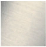
platinum matte 20 006 705-06