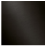
Dark Platinum matte 20 006 705-99

More custom finish options are available via special production (xTra Service). Please see our finish matrix for availability and pricing or contact a Dornbracht representative.